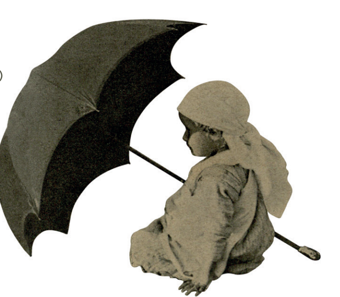
Photo: Ludwig Boedecker, Sunday Afternoon on the Banks of the River Viliys Bilderschau der Wilnaer Zeitung, 1916. Source: The Wroblewski Library of the Lithuanian Academy of Sciences, Rare Books Department